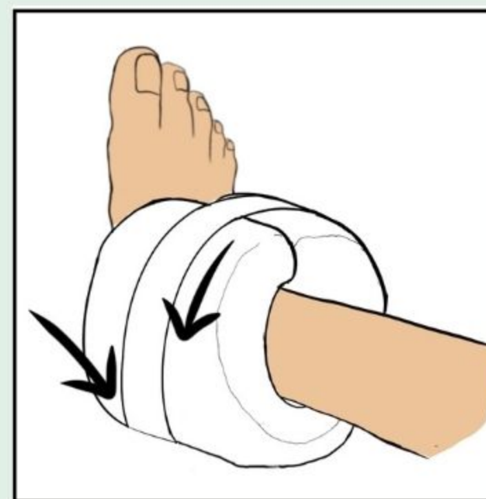
Check that the band does not obstruct blood circulation.