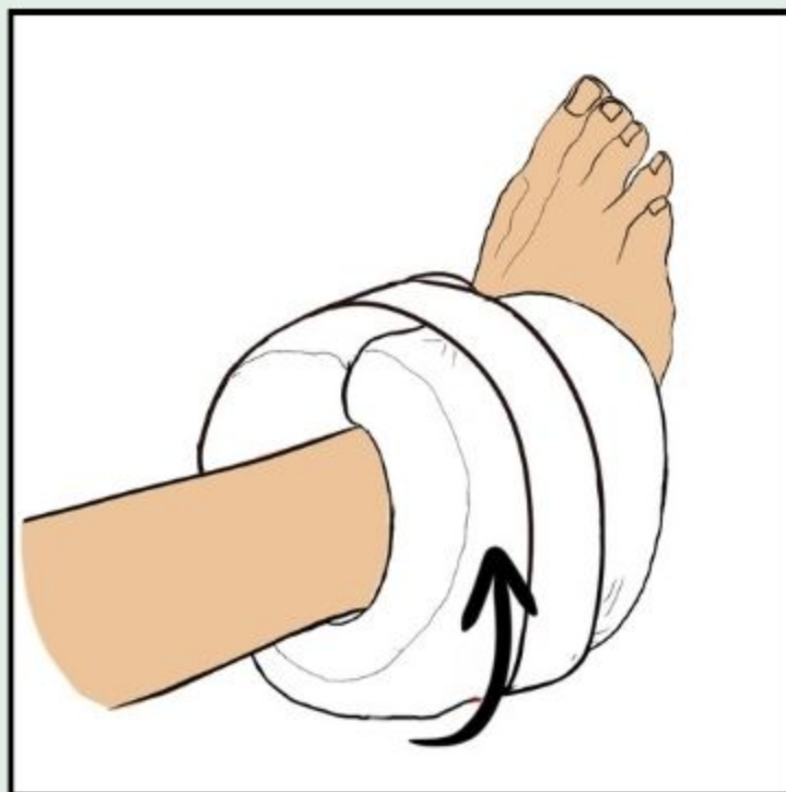
Secure the band to the wrist with Velcro.