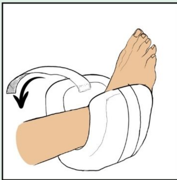
Put the pillow around the patient's ankle.